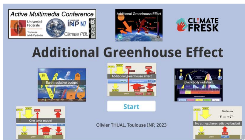
Figure 3 : First page of the example/template for the H5P resource to deliver