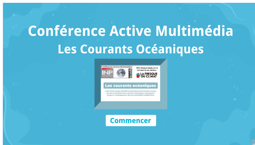
Figure 3 : First page of the example/template for the H5P resource to deliver